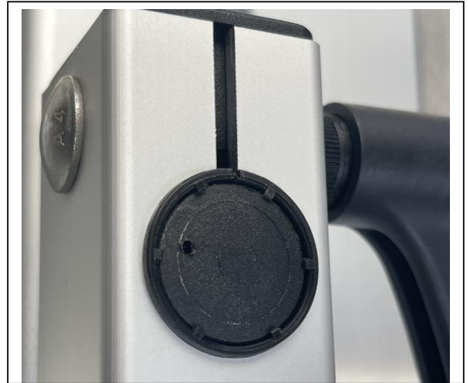
Tap is inserted flush into Bushing