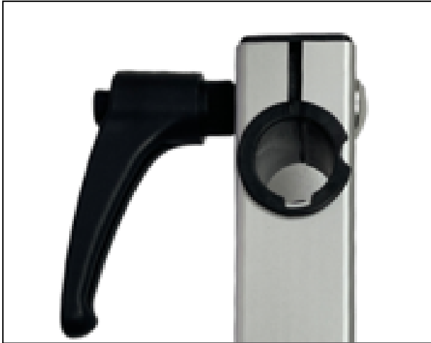
Washer portion of Bushing faces towards Taps

New Bushings are being implemented to include 'teeth', which will prevent the Arm from being assembled upside down.